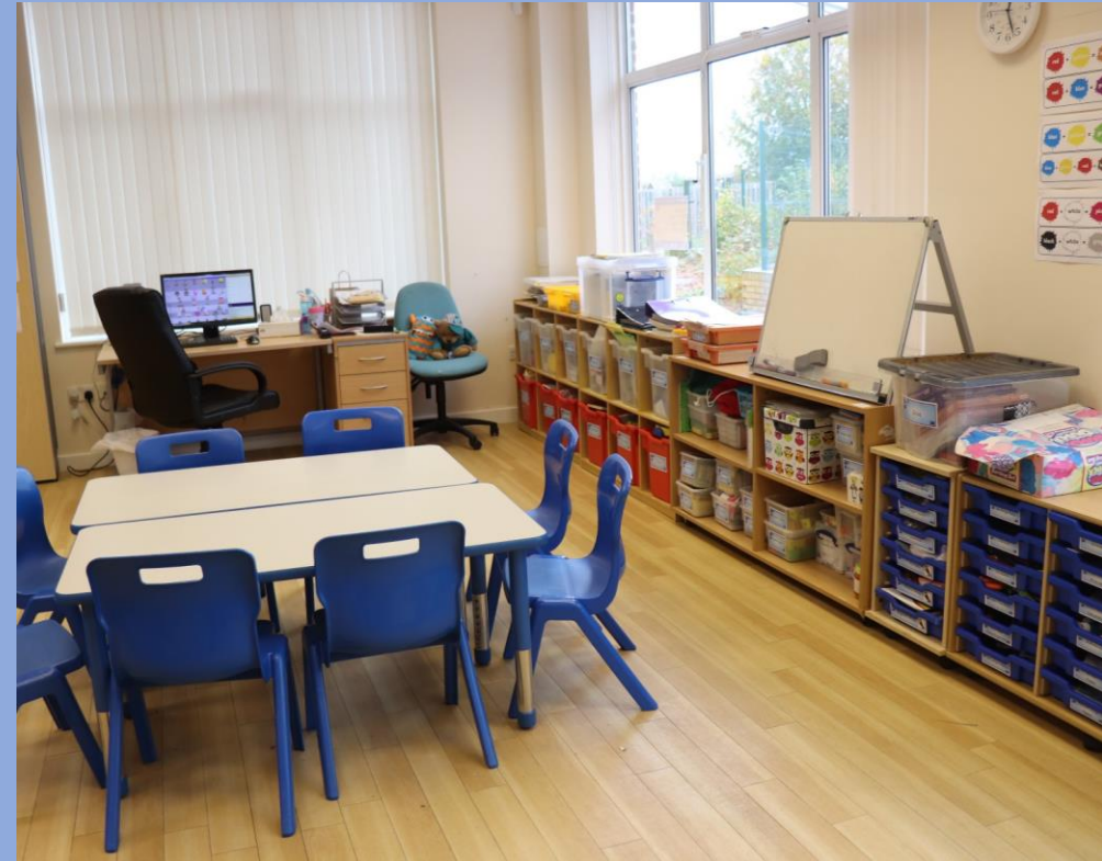
Our Lilac classroom provides a learning base for children with additional needs.