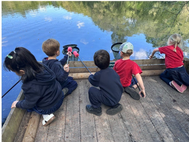
A marvellous time was had by all at Wellington Country Park