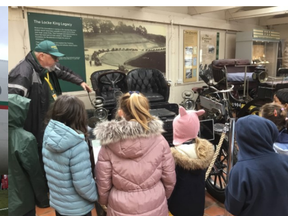
Year 2 had a fabulous time at Brooklands Museum