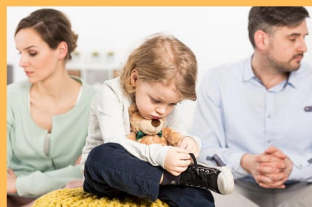
Woking Family Centre

We hope your child enjoys this special opportunity.