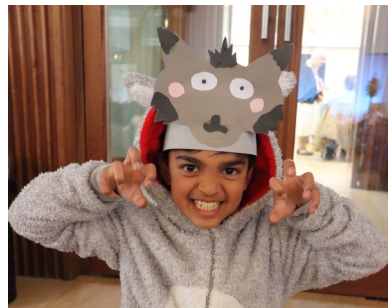
National Numeracy Day