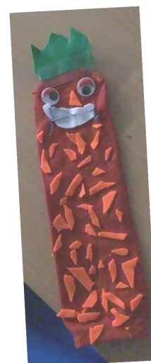
Issy's strawberry sock puppet