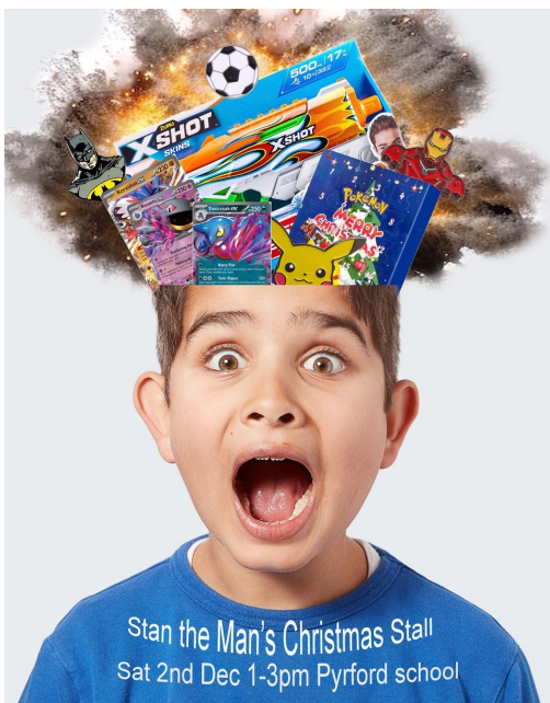
Stan the Man's Christmas Stall Sat 2nd Dec 1-3pm Pyrford school

https://raffall.com/348509/enter-raffle-to-win-pyrford-christmas-raffle-hosted-by-pyrford-primary-school-christmas-raffle