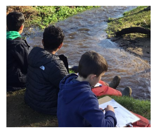
Year 6 Juniper Hall River Study

Linked to my Geography lead teacher role, I am also responsible for the Eco Team. This committee has a representative from each class across the school and we meet 2 or 3 times a term to talk about environmental issues and sustainability. This year, the Eco team have organised a second-hand clothes sale, an energy saving week and completed an environmental review.