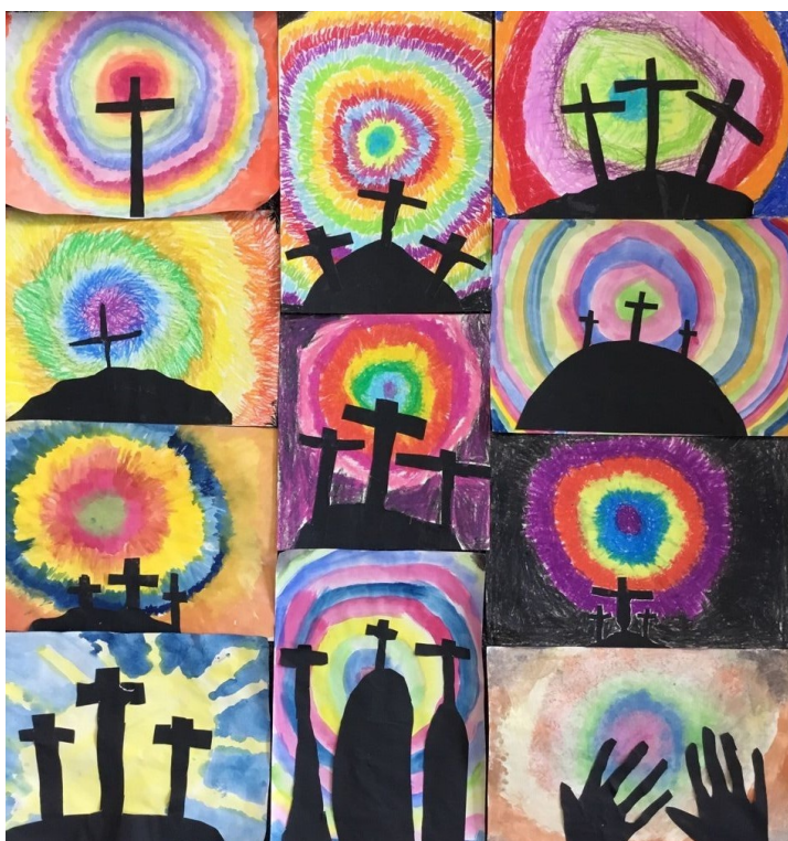
Easter Pause artwork on the theme of forgiveness

In Year 3 we looked at the Easter Story and talked about some of the disciples who might need and deserve forgiveness. We thought about times when we might have needed to ask for forgiveness from others and how Christians believe Jesus died on the cross so people would be forgiven.