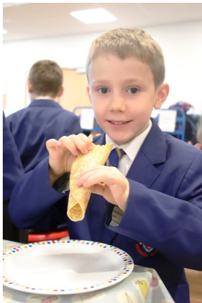
Pancakes at Breakfast Club on Shrove Tuesday Yummy!

No KS2 Golden Book this week as Ash Wednesday service instead