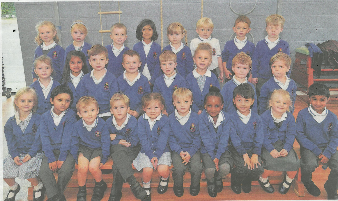
Pyrford C of E School, Beech Class